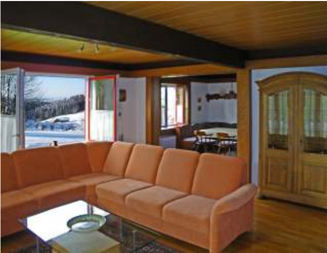
Living room, Dining room in the Background