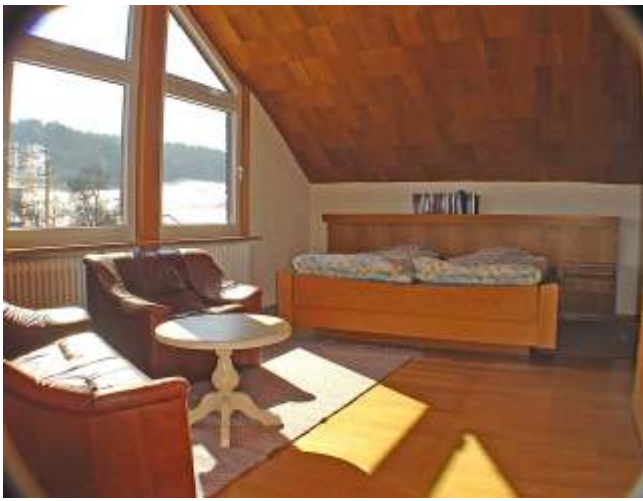
Bedroom 3, 2nd floor