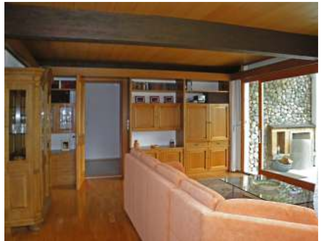
Living room with passage to the Wintergarten