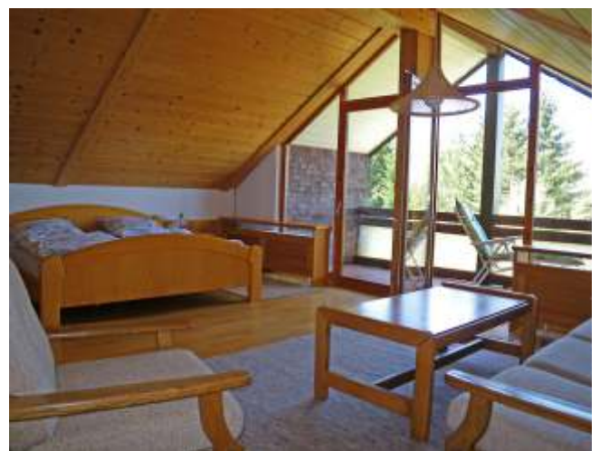
with roofed balcony