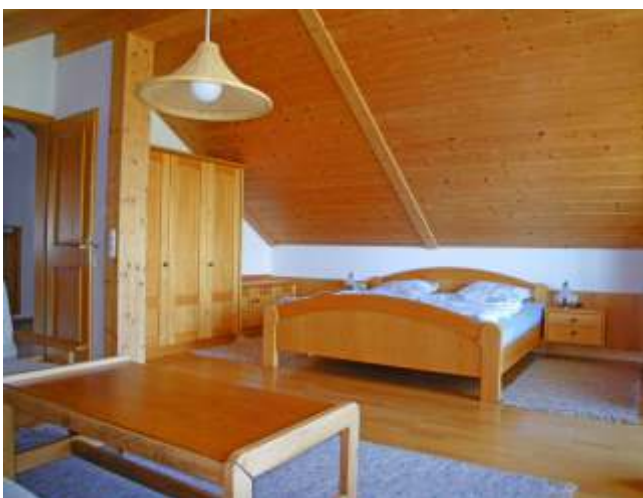
Bedroom 2, 2nd floor