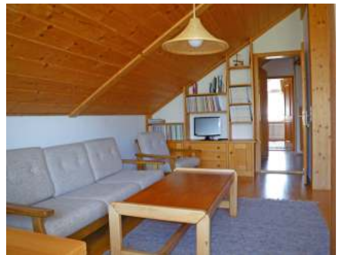
Bedroom 2, 2nd floor, living area