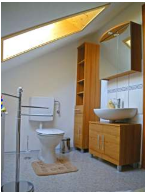
Bathroom, 2nd floor Bathtub, WC