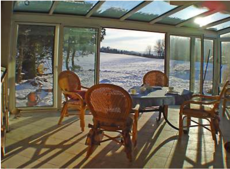
big winter garden with open chimney