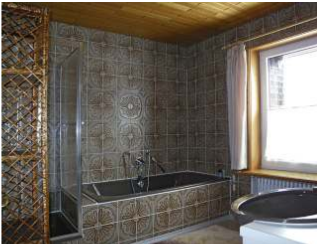
Bathroom with shower, Bathtub, Bidet, 2 WB